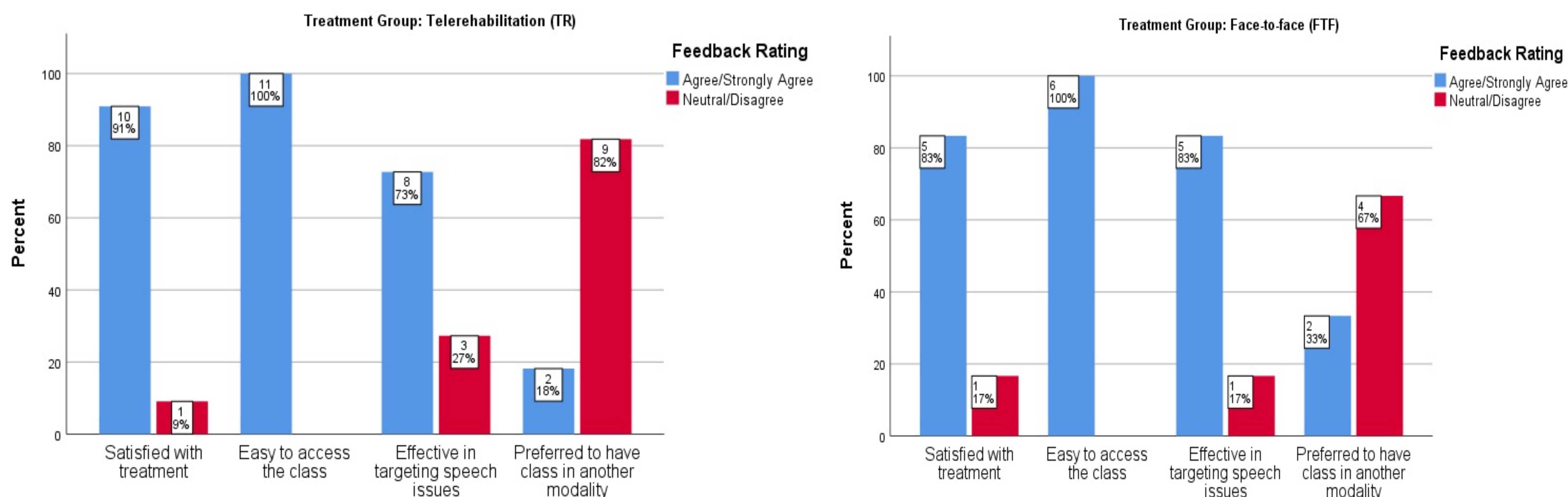
Figure 1: Distribution of participant feedback ratings

*p values are obtained from two sample t-test for continuous variables, and Chi squared test for categorical variables. SD is standard deviation.